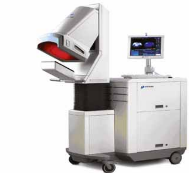
Fig.1. The ComfortScan optical mammography system. The patient stands upright and her breast is placed in the breast holder. The entire procedure takes less than 10 min.